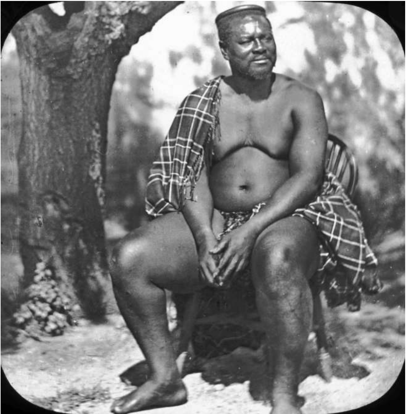
Image 13: This is probably a photo of the famous Zulu Chief Cetshwayo, KwaZulu Natal, South Africa c1879.