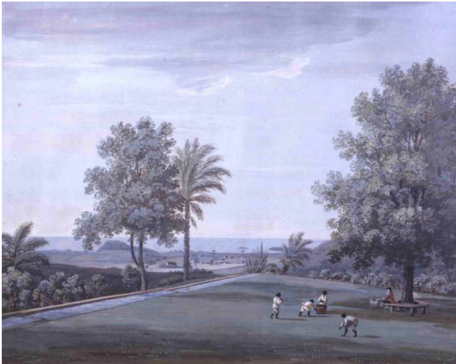
Image 3: A romantic view of a plantation in the West Indies, far from the harsher reality witnessed by enslaved Africans.