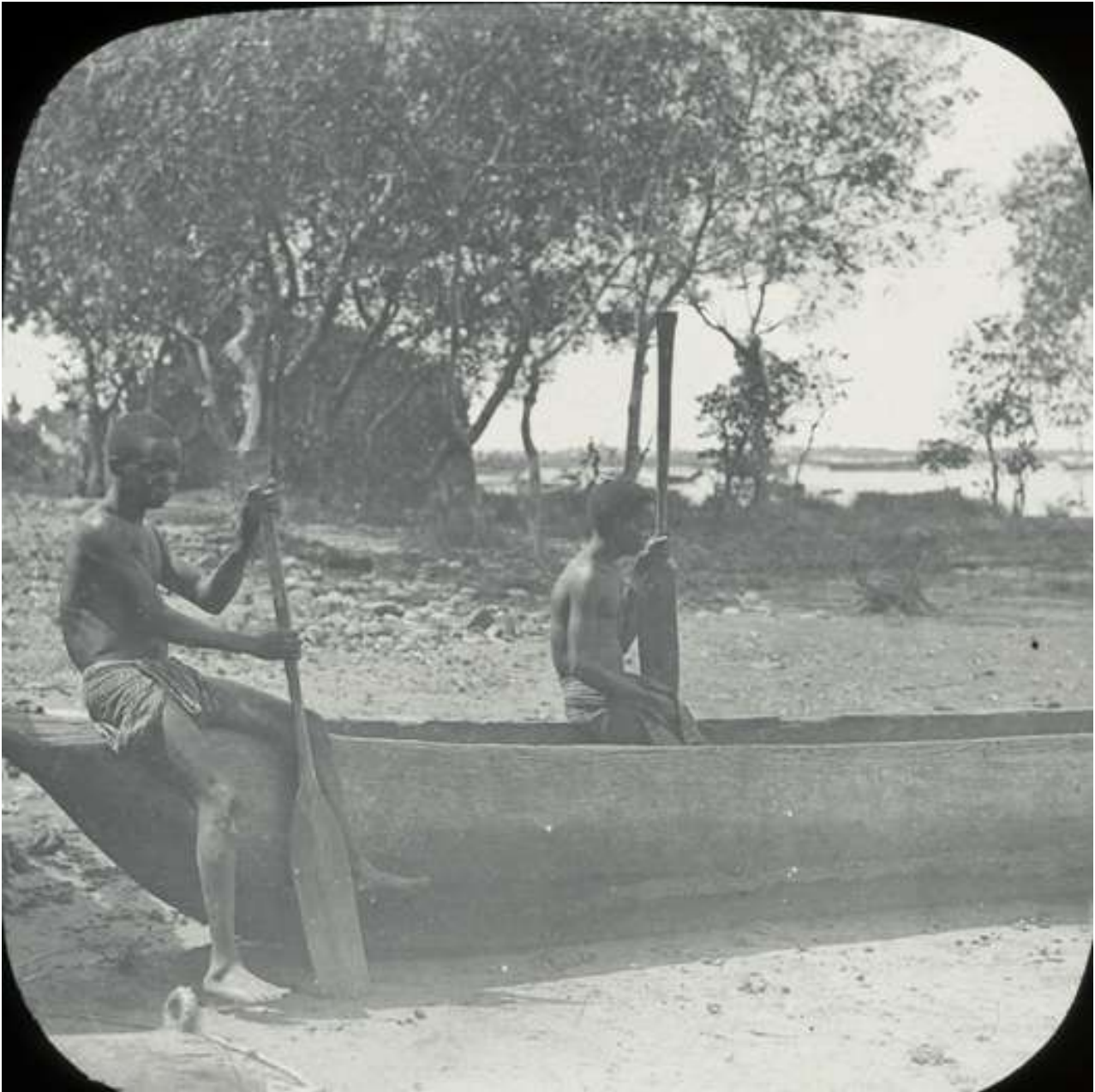
Image 14: Carved wooden boats used in the East Coast of Africa helped trade with countries like India and China.