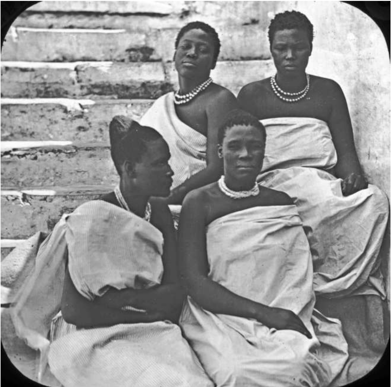
Image 7: The wives of the famous Zulu chief Catchwayo, KwaZulu Natal, South Africa around 1879.