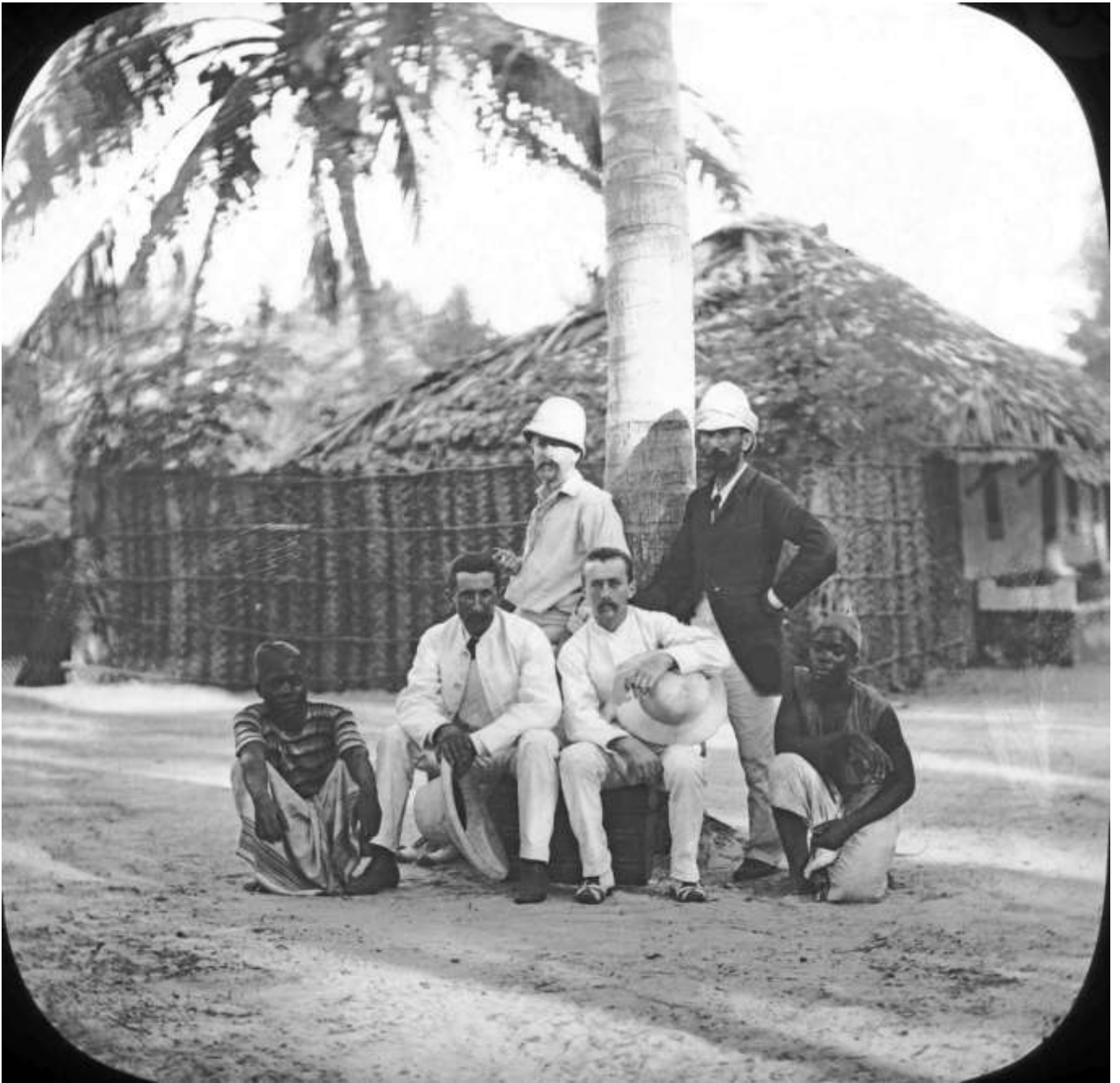
Image 10: East Coast Africa Group of Explorers and Consuls.