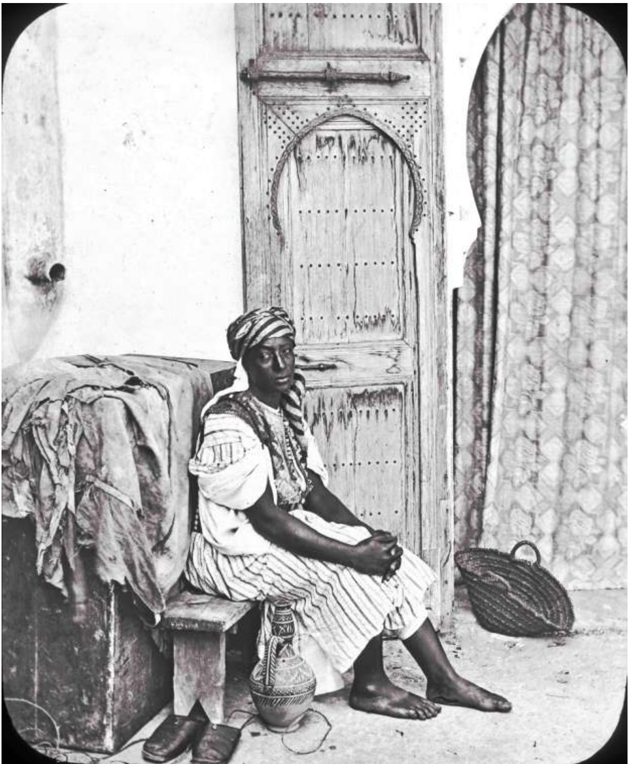
Image 4: One of two Victorian portraits of enslaved Africans in Morocco.