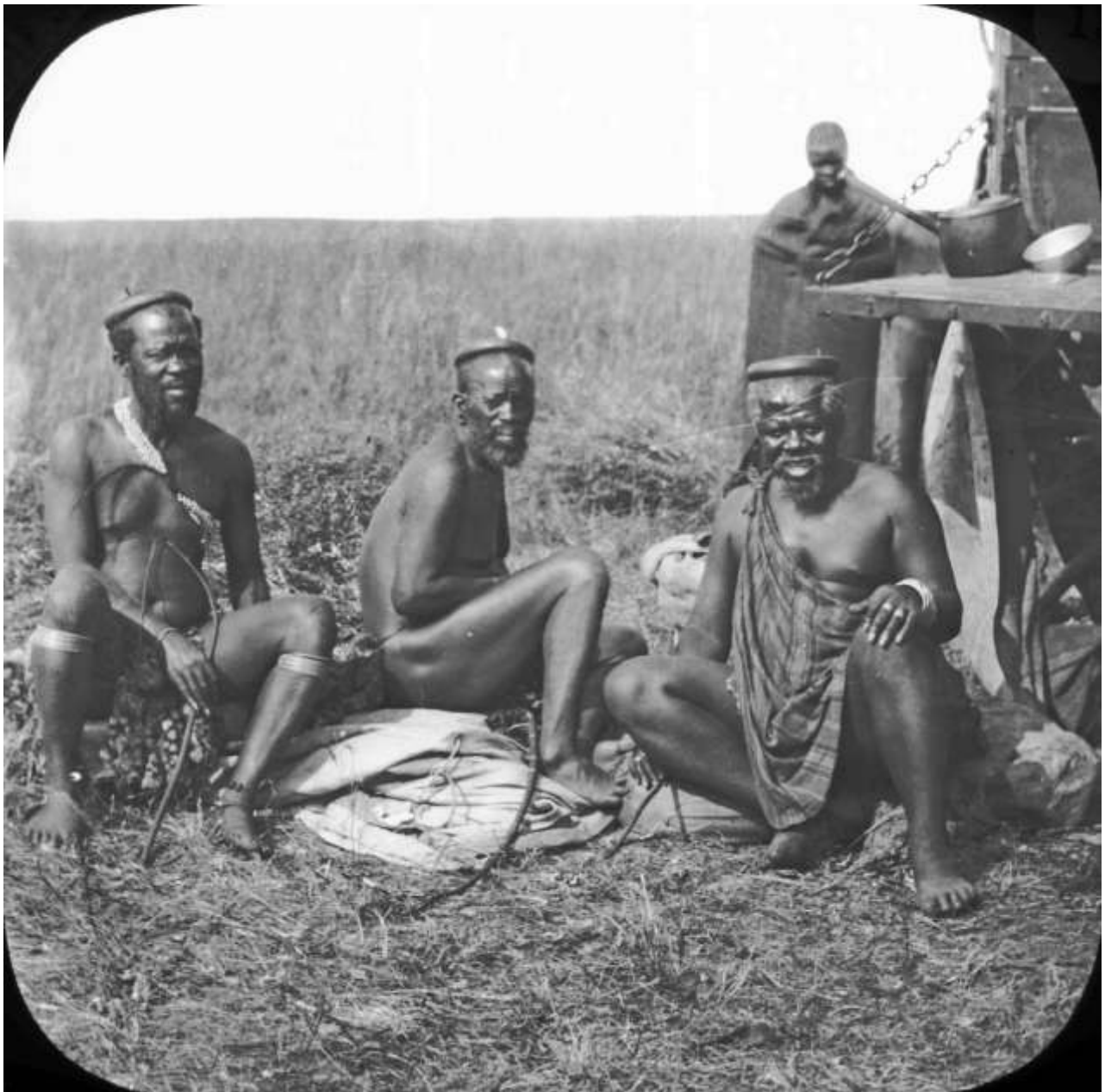
Image 12: East Coast of Africa eldermen.