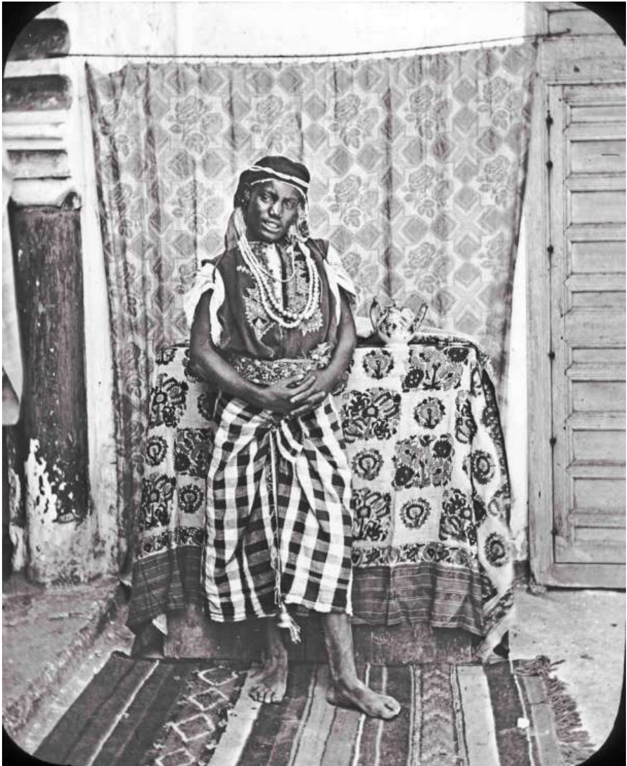
Image 5: One of two Victorian portraits of enslaved Africans in Morocco.