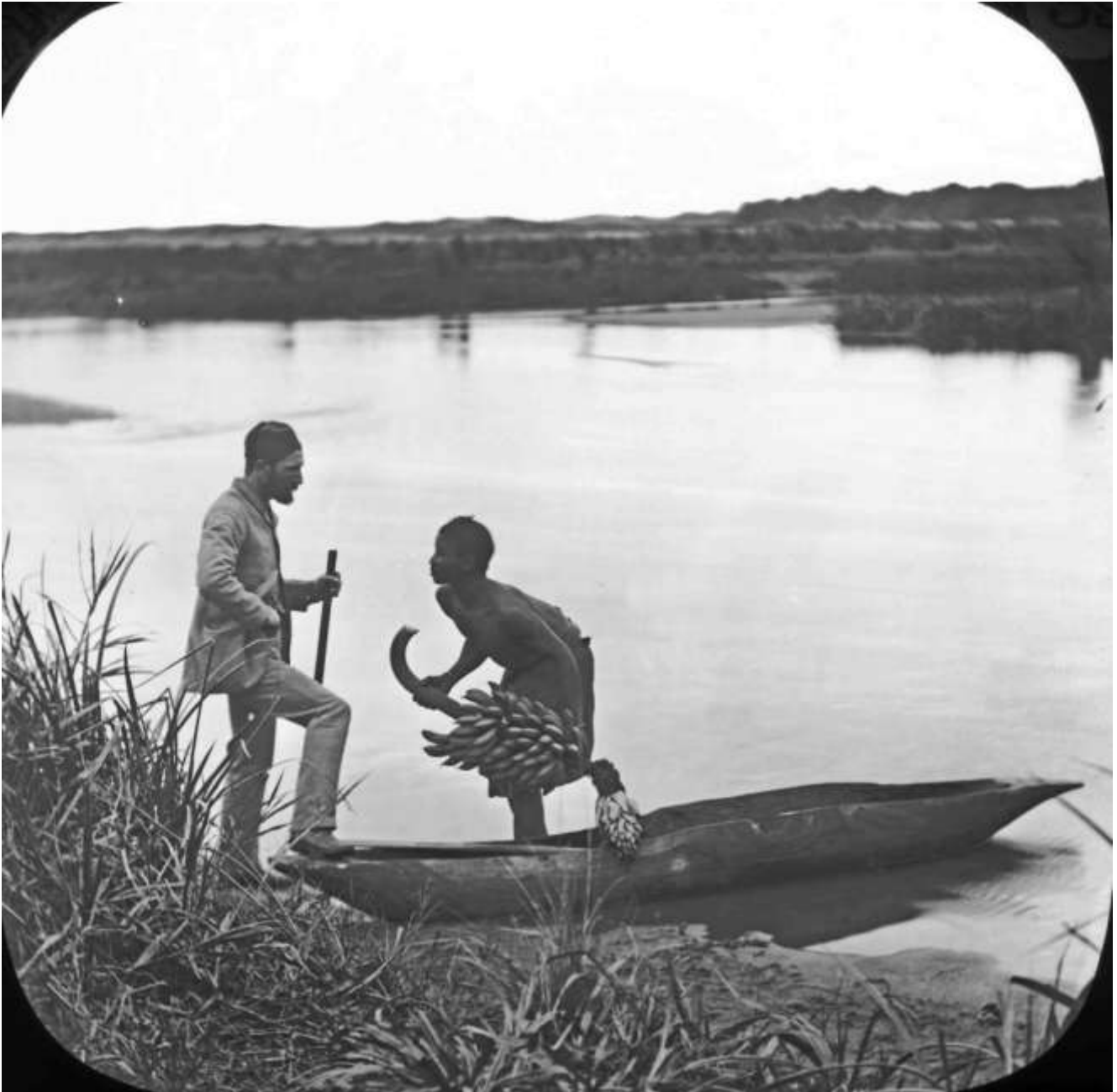
Image 11: A Victorian portrait entitled 'A gift of fruit' embodies the image of European explorers in Africa at the time.